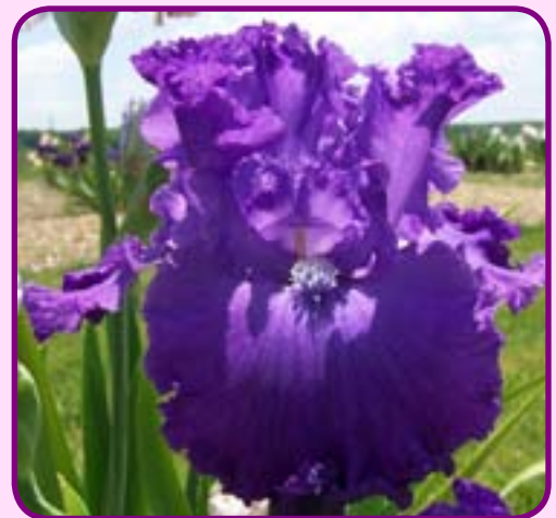
UNBRIDLED BEAUTY (Barabara Nicodemus)