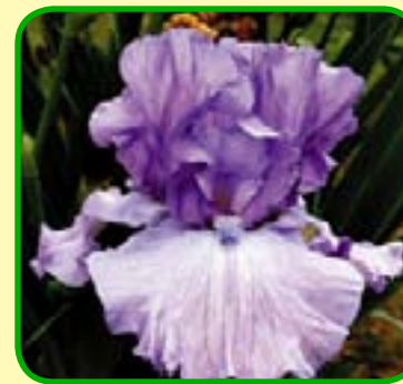
One Man Band