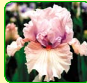
Days Gone By