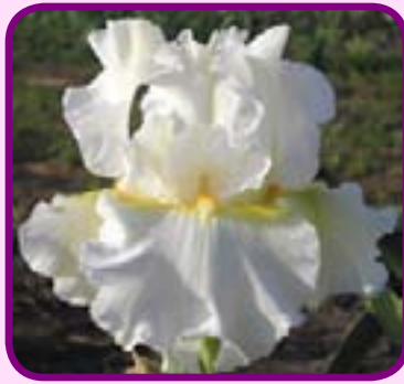
Johnnie's Opal Angel