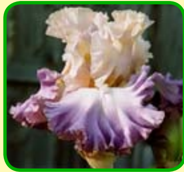
Tango to the Moonlight