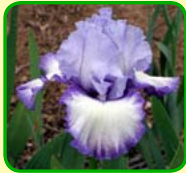
Shades of Meaning