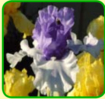
Chance of Showers