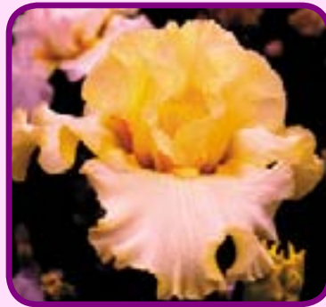
Temple of Lights