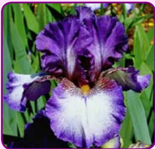
ROYAL SLIPPERS (Margie Valenzuela)