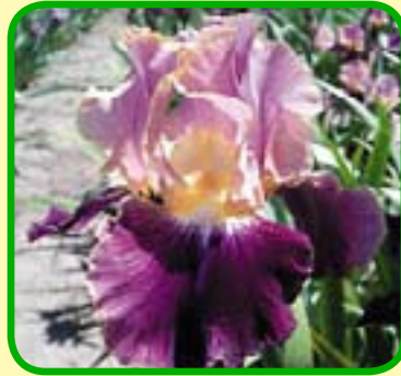
Drew A Royal Flush