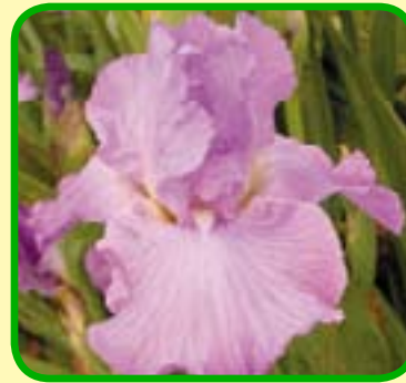
And Away We Go