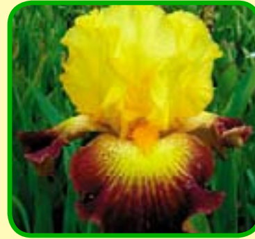
Burst of Glory