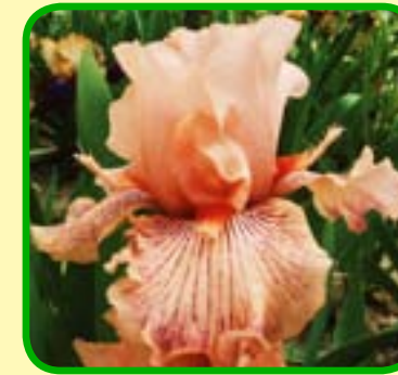
Lip Smacking Good