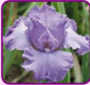
Legacy of Lace