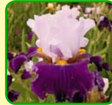
Drive My Car