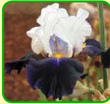
Grace Upon Grace