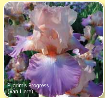
Pilgrim's Progress (Van Liere)