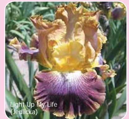
Light Up My Life (Jedlicka)