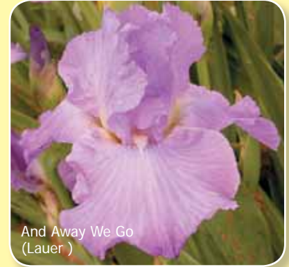
And Away We Go (Lauer)