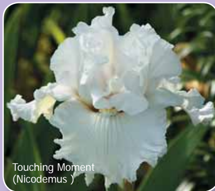
Touching Moment (Nicodemus)