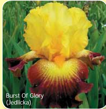
Burst Of Glory (Jedlicka)