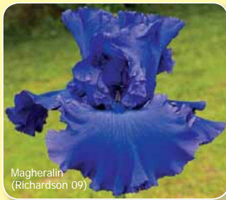
Magheralin