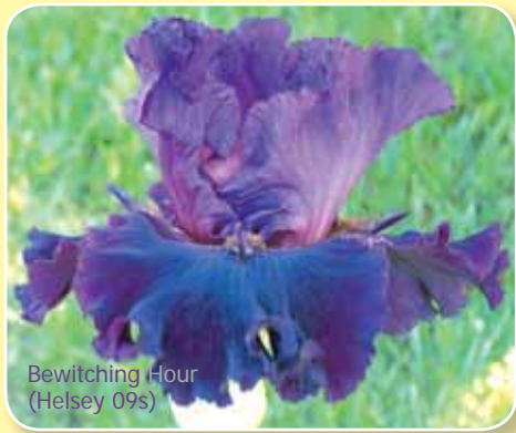
Bewitching Hour (Helsey 09s)