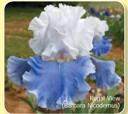
Regal View (Barbara Nicodemus)