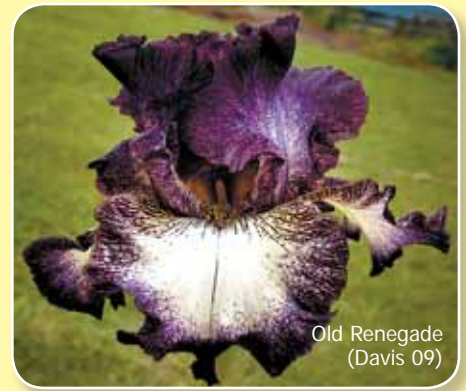
Old Renegade (Davis 09)