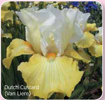
Dutch Custard (Van Liere)