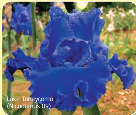
Lake Taneycomo (Nicodemus 09)