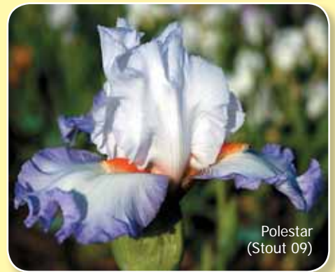
Polestar (Stout 09)