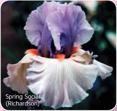
Spring Social (Richardson)