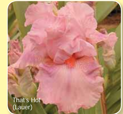
That's Hot (Lauer)