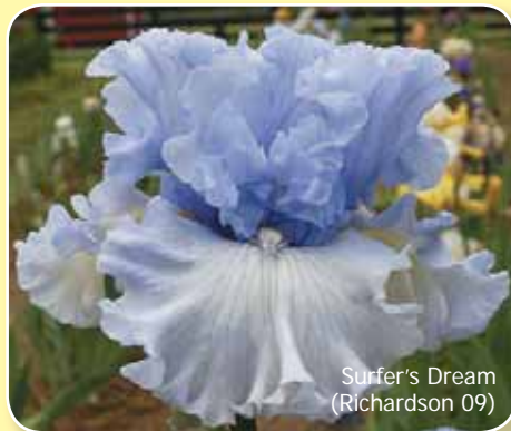
Surfer's Dream (Richardson 09)