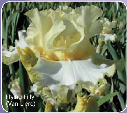
Flying Filly (Van Lier)