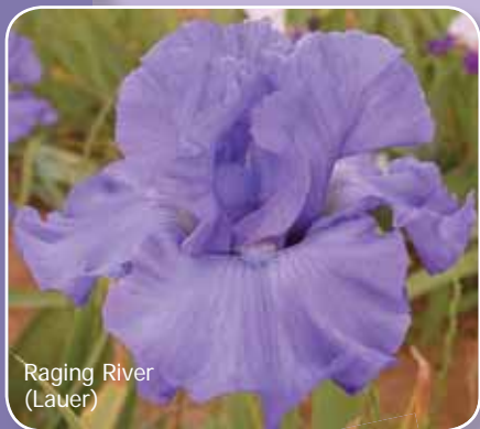
Raging River (Lauer)