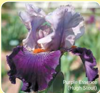
Purple Essence (Hugh Stout)