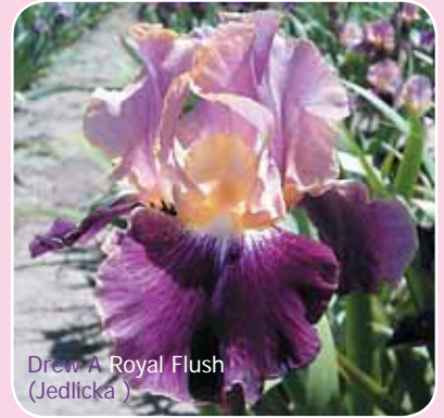
Drew A Royal Flush (Jedlicka)

Zippity Doo Dah (Van Liere 08) Very open standards are cool, silvery-white with lilac influences. The flaring pearl falls have ruffled light-yellow borders and lighten to lavender-white around sienna/violet beards. Not at all gaudy, these charming flowers are attractively and carefully appointed. Retail Price $35.00 ..... Your Price $15.75