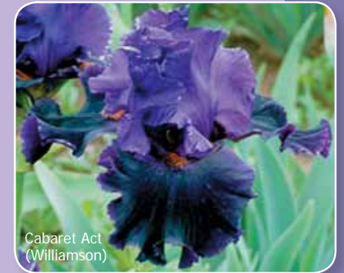
Cabaret Act