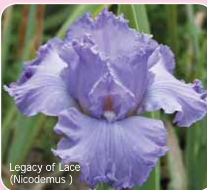
Legacy of Lace (Nicodemus)

Three Ring Circus (Jedlicka 07) White standards have bright yellow centers and veining; yellow style arms. Falls have white centers and deep red/ purple rims. Yellow pours down both sides of the falls from the yellow striping around the hafts; bright orange beards. Retail Price $30.00 ..... Your Price $12.50