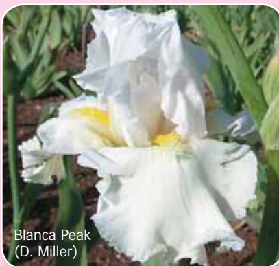
Blanca Peak