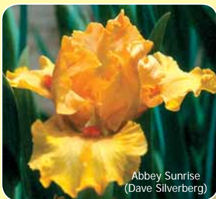
Abbey Sunrise (Dave Silverberg)