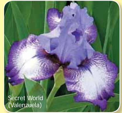
Secret World (Valenzuela)