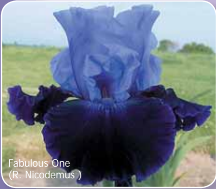
Fabulous One