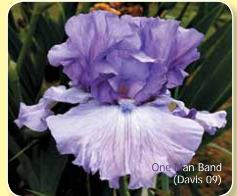
One in a Band (Davis 09)

Each of these varieties are also available for purchase in the catalog listing. Quantity pricing is available.