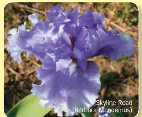
Skyline Road (Barbara Nicodemus)