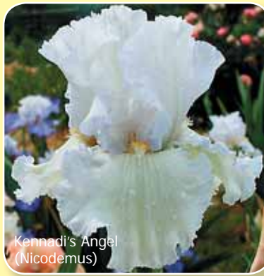
Kennadi's Angel (Nicodemus)

That's Hot (Lauer 08) Standards are bright rose. Falls are Venetian-pink with cyclamen-purple shoulders and mandarin-red beards. Ruffled and laced flowers have fine show stalks with 7-9 buds. Sweetly fragrant. Retail Price $35.00 ..... Your Price $13.50