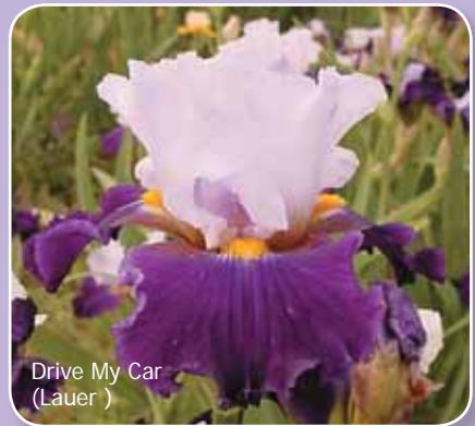
Drive My Car (Lauer)