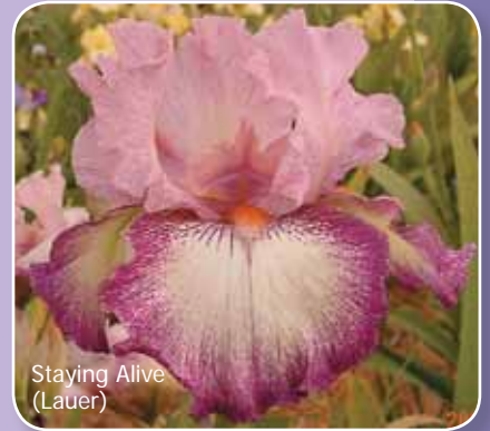
Staying Alive (Lauer)