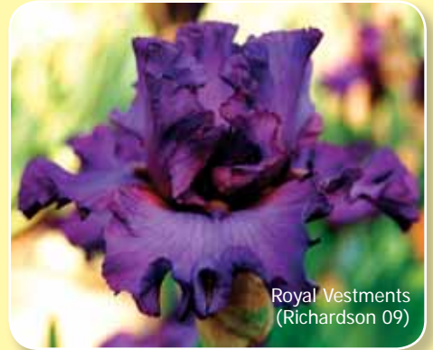
Royal Vestments (Richardson 09)