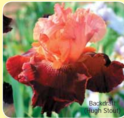
Backdraft (Hugh Stout)